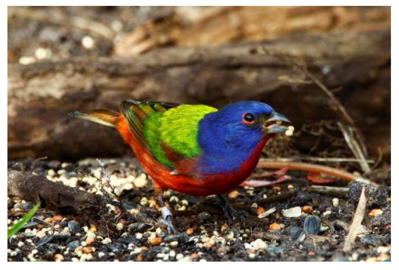
PAINTED BUNTING