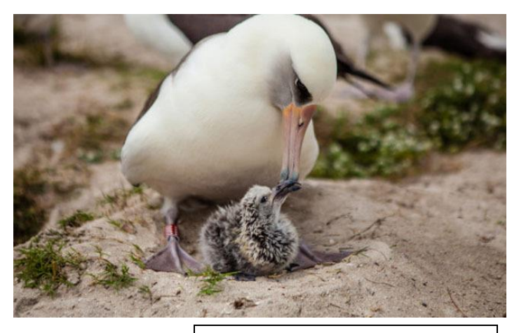
Wisdom with her chick Kukini