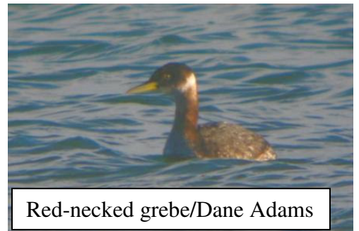
Red-necked grebe

the morning by Dane Adams was no longer present. Dane captured a nice digiscoped photo clearly showing the size difference between a cackling goose and the larger Canada goose. The highlight bird was a red-necked grebe that was viewed by all the birders present. There were also numerous redheads and canvasbacks on the reservoir.