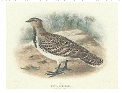
Malleefowl in Wikipedia

To me the most interesting nest of all is that of the malleefowl of Australia. Check it out!