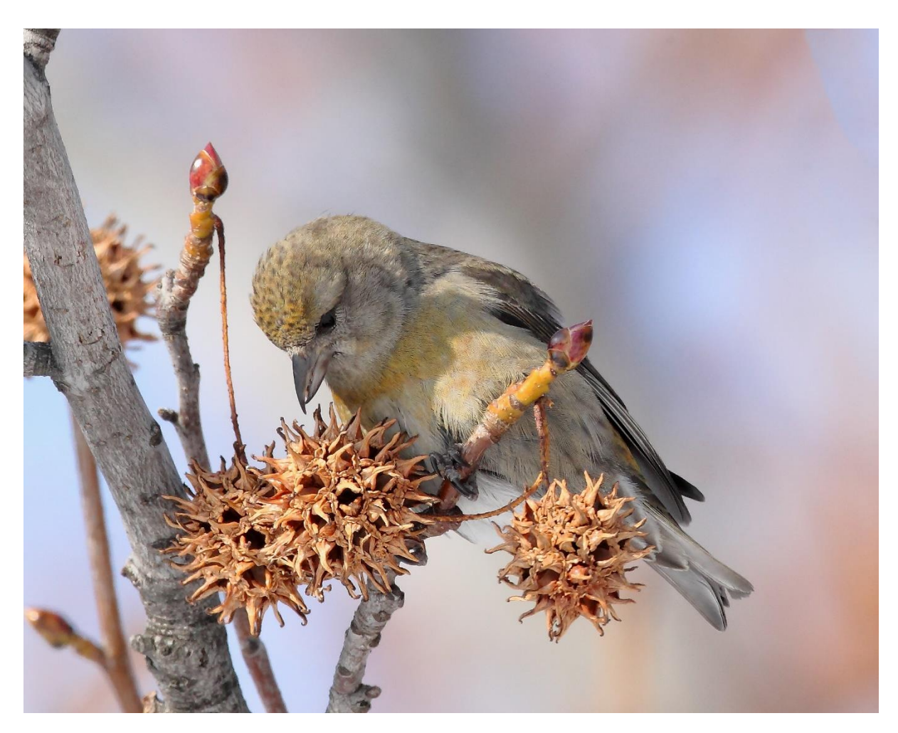
RED CROSSBILL (female)