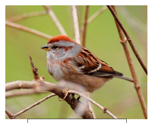
AMERICAN TREE SPARROW