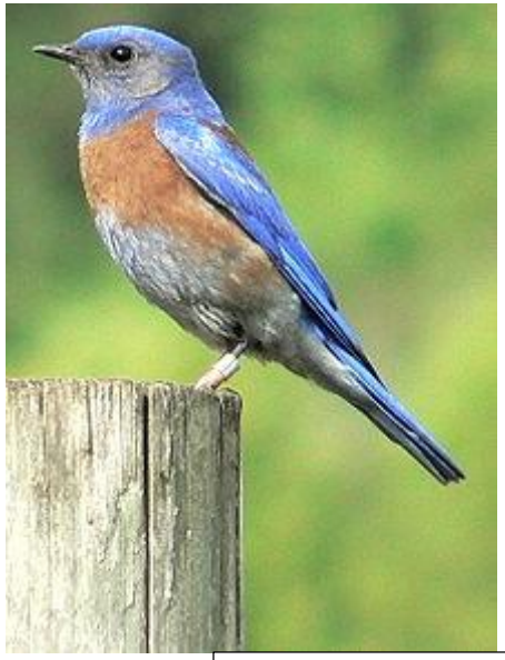
MOUNTAIN BLUEBIRD