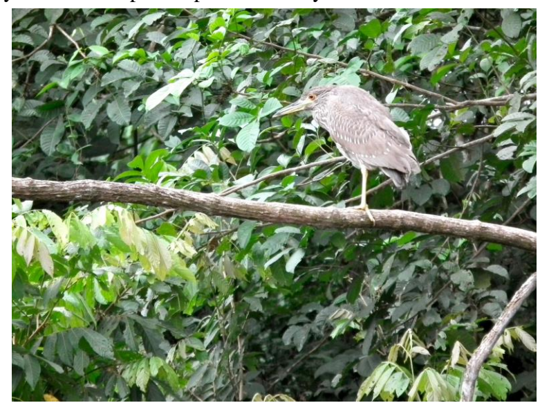
Juvenile green heron in Costa Rica.

I have usually seen a green heron just as it is shown in John Koscinski's excellent cover photo, furtively creeping along logs or in the grasses by swamps and marshes. That makes sense because its diet is made up of small fish, crustaceans, and frogs.